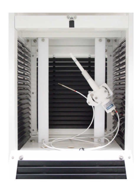
HMP155 with an additional temperature probe and optional Stevenson screen installation kit.