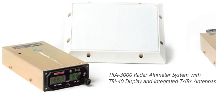
TRA-3000 Radar Altimeter System with TRI-40 Display and Integrated Tx/Rx Antennas

Critical safety tools for precise, low altitude navigation